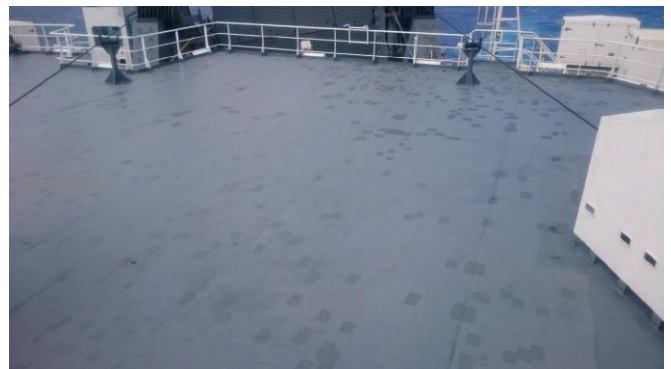
Upper deck after treatment

According to the Goliath Leader Captain: "The Coating is withstanding good and no any further painting or traces of rust observed" .