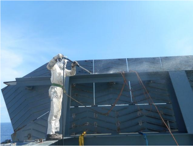
Surface preparation - high pressure water